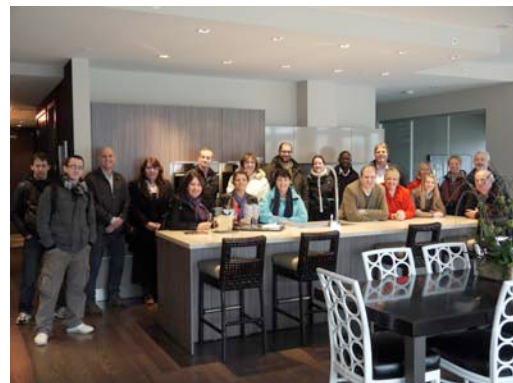
Making ourselves at home in the luxurious penthouse

The rest of the afternoon was spent drying out, visiting the city, shopping or relaxing at the hotel. Many of us gathered in the hotel restaurant for dinner and then turned in early to be ready for our last day in Vancouver.