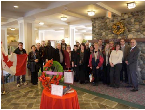
With our hosts in the lobby at Shannon Oaks

Outside each unit a glass case is provided for residents to display favourite items and personalise their entrance, and the units themselves provide bedrooms, separate living rooms and kitchenettes. Other facilities at Shannon Oaks include: a large garden with private plots for those able to tend them and a mini-golf course, a beauty salon, a coffee shop, a private dining room which can be booked for celebrations, a library with internet access, and downstairs and pool room and a huge auditorium with a cinema screen.