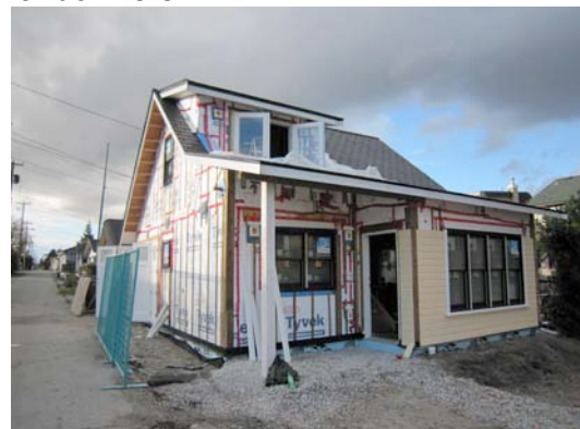
A Laneway house under construction, Vancouver suburbs

These buildings are typically around 500 sq feet, which make them very small against Vancouver house types, which can be well in excess of 2,000 sq feet. They provide an alternative low energy, high performing unit for landowners.