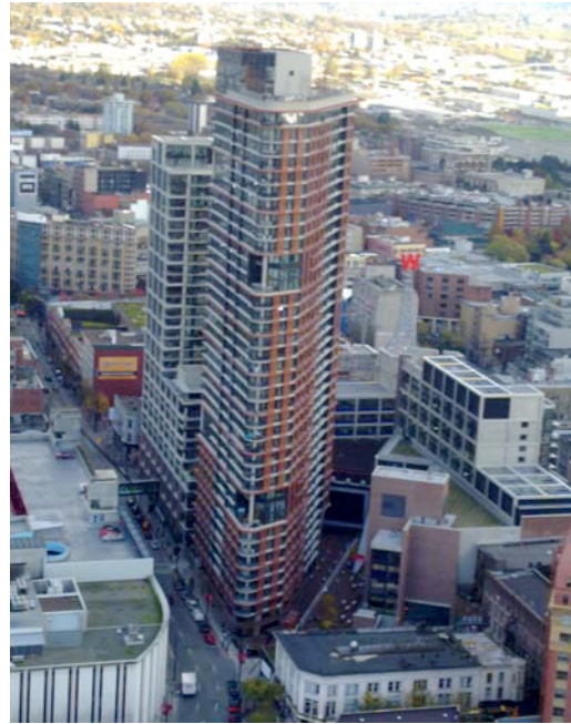
The regenerated Woodward's building seen from Vancouver Lookout

We reassembled bright and early on Monday morning to travel to east down-town and the Gas Town area. We met outside the Woodward's Building, a mixed-used mixed-tenure regeneration scheme on a former department store site. Our guide for the morning was architect Gregory Henriquez, who provided a brief history of the site before showing us around.