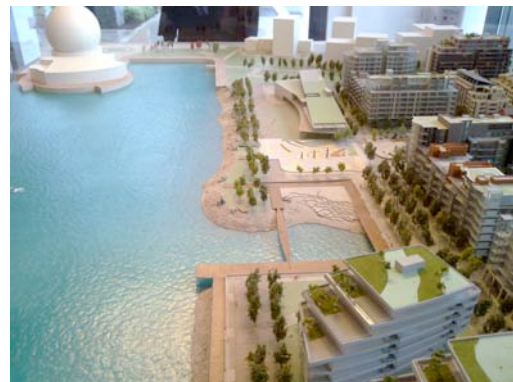
Model of Olympic village