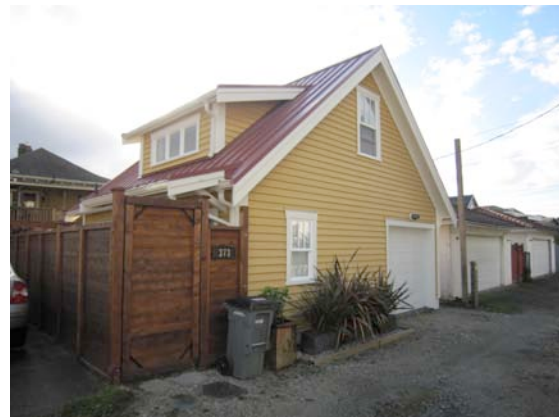
A completed Laneway house

predominately occupied by old garages and parking spaces.