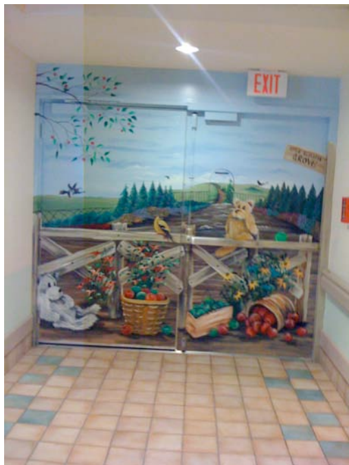
Painted doors at Fairhaven

The centre has several restaurant areas, a beauty salon and a gift shop, communal and private sitting areas and a Chapel for regular and memorial services, and offers daytime activities like baking and arts and crafts. We were impressed by the sensitive yet innovative approaches taken at Fairhaven to protect residents, such as painting the doors in the special care unit with murals to disguise them in order to protect vulnerable residents.