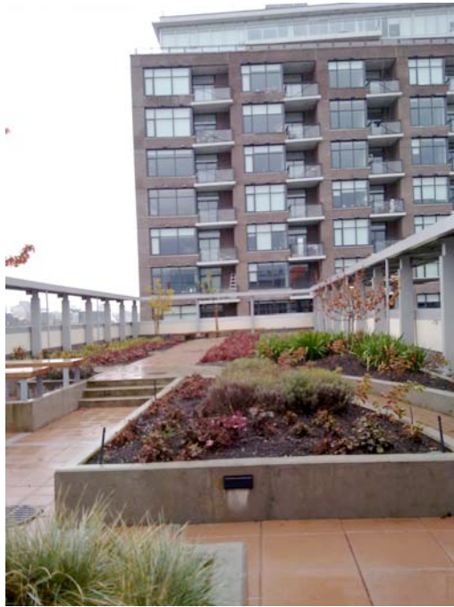
Roof terraces on an affordable housing block

most sustainable development in Canada. Heating for the building is taken from a neighbourhood plant which captures the heat from the local sewage system, and the roof space is covered with a large scale solar thermal system. Individual plots on the roof terrace will be allocated to households who wish to grow vegetables.