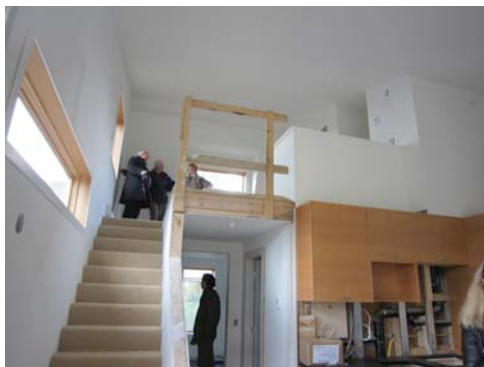
Interior of a Laneway house

The tour group was able to look around West House prior to occupation in early 2011. The new occupants would be asked to provide feedback and monitoring of the various systems in the house that incorporate much of the latest technologies in heating, insulation control systems and PV energy panels on the roof. The group also visited three other Laneway properties, from a small senior's home of around 500m to a much larger downscaling home, where the original homeowners live in the laneway property at the rear. They now let the main house that fronts the main street, which provides an investment income and nil mortgage on their downscaled Laneway home.