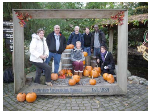
Members of the group at the Capilano Suspension Bridge Park