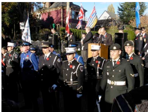
Service Personnel at Honour House opening