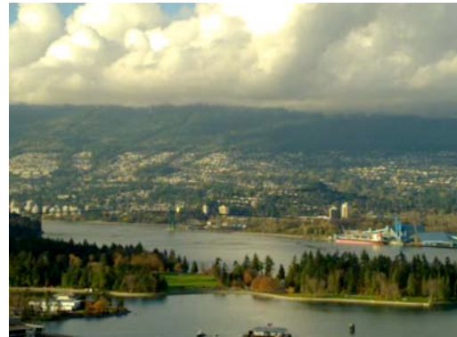
View over Stanley Park to North Vancouver

beautiful Stanley Park and, for some members of the group, visiting friends and family in the area.