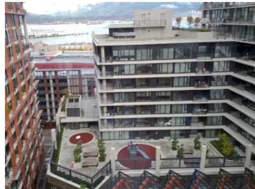
Affordable homes at the Woodward's development

Gregory led us on a tour of the residences, including affordable family homes, private sale and rental units and the block specifically designed for single homelessness people. The affordable housing units were funded through $50m in grant from BCH. The group was impressed by the inclusive approach to regeneration which aimed to enable existing residents to stay in the neighbourhood at affordable rents, and the project has been hailed as the most inclusive mixed use building in the history of Canada. We also visited Simon Fraser University's new 'black-box' theatre in the basement.