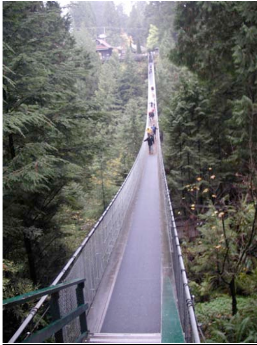
The terrifying heights of Capilano Suspension Bridge