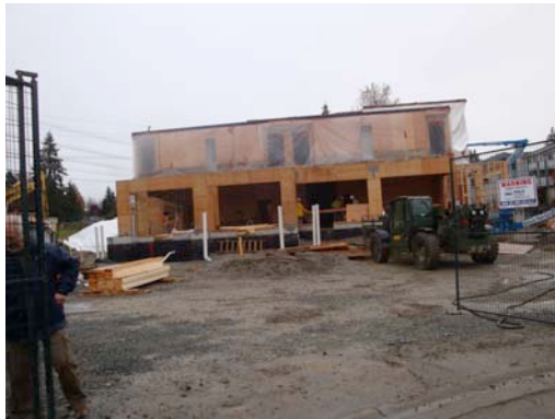
Modular housing under construction in Surrey

Each module measures 60ft x 40ft, weighs up to 45,000pds and has three pick-up points. Twenty-six modular units are being put together at the site to provide fifty units of accommodation over three storeys. The only use of bricks and mortar has been for stair wells and elevator shafts which have been constructed on site.