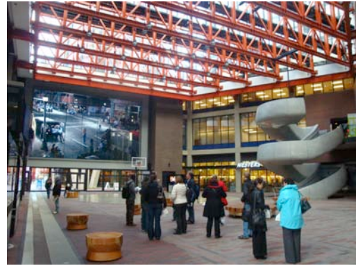
Woodward's atrium with photographic mural

Three towers namely; the Abbott Tower, the 'W' Tower and the West Hastings Building have been added to the old Woodward's building. The social housing residents include original local residents from the Downtown East side and fifteen former squatters of the old Woodward's building. The 10 th floor of one of the new towers contains a gym, an outdoor kitchen, space for BBQ, internet access points, a communal laundry and a furnished living space with a 52" flat screen TV. The iconic red 'W' shop sign has been retained and has even been replicated in the W-shaped hot tub on the roof terrace!