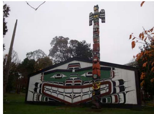
Totem in Victoria